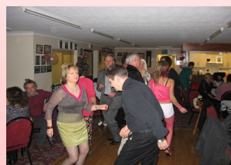
Party goes enjoying themselves

There are a few events planned, wine tasting, The "Y" factor and a slave/skills promise auction but to name a few, with the details, dates and venues to be confirmed.