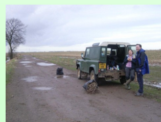
Some of the photo's taken on volunteer days.