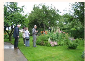
Our gardens attracted so many visitors on the Nation Open Gardens Scheme day.

A huge thank you goes to everyone that has supported our events this year and we look forward to your continued support.