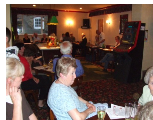
A good night was had by all at the slave auction.