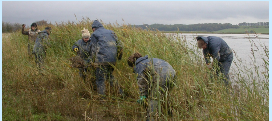
A group of volunteers, transplanting reedbeds.

If you want more information about the site, please contact the site staff on 721269.