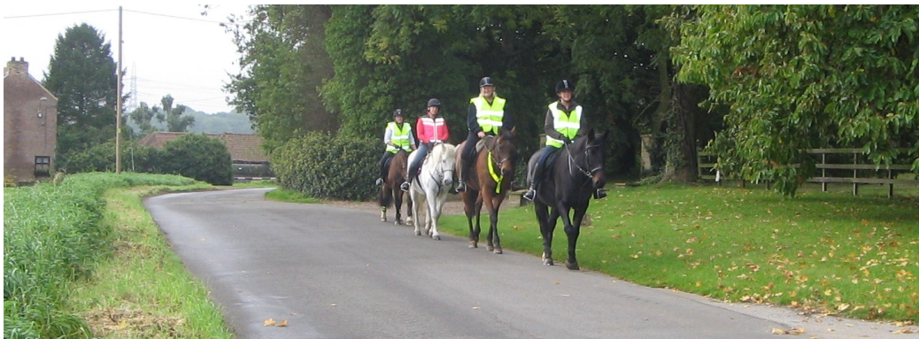
A group of members from Alkborough & District Saddle Club enjoying one of their regular buddy rides out.

We will be offering the sale and fitting advice of horse and rider high viz merchandise via a local tack shop on the day along with a raffle. We are expecting a lot of media interest as my police contact has already informed me of this being the case when they have supported such events in the past. All this I am sure you will agree goes a long way in developing good community relations and public awareness within our local communities.