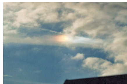
Strange lights seen over Alkborough

Local ufologists said they had received many reports of activity in the area and had teams searching for clues.