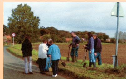
Some of the volunteers with spades ready

This was done in conjunction with North Lincolnshire Councils, Neighbourhood Services Department so hopefully the flowers will not be mown down in spring.