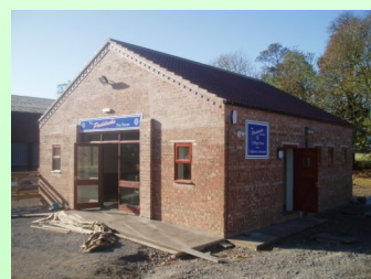
The Paddocks Tea Room

The opening hours for the winter season will be Thursday to Monday 9am to 5pm.