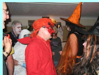
Party goers enjoying themselves

"When's the next event?" Well its on Sat 9 th Feb - see you there. Tickets are available in the new year, get yours early numbers are limited.