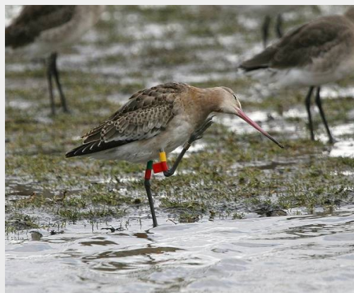
Black Tailed Godwit

Finally, we held the first minibus tours of the site on the 29 th September and the 1 st October. These dates coincided with the highest tides of the year. The tours were a great success with 107 local people taking part over the two days. It gave people a chance to see the site, to hear about the changes that are going to take place and of course to ask questions. If you missed the tours we will be arranging more in due course when there have been further developments on site.