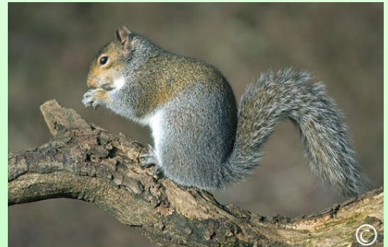
The grey squirrel

I do not believe, however, that we need be concerned that we have living in our woods a breed of bushy-tailed, violent ambushers lying in wait for unsuspecting walkers. Rather, this was a squirrel that did not look before it leaped and was possibly as shocked as I was. Perhaps we should set up a school of etiquette for our local wildlife to ensure injuries to humans are kept to a minimum!