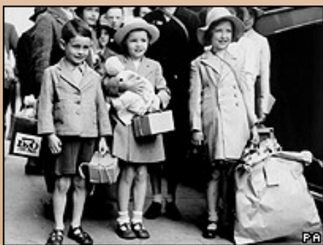
Children during the war